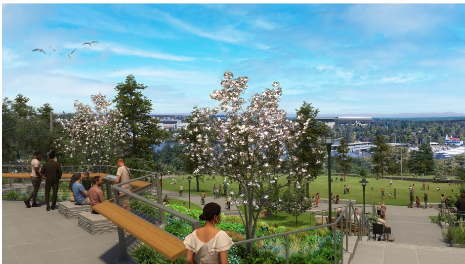
The new Roanoke lid will provide green spaces for community members to enjoy.

Для получения информации на русском языке, пожалуйста, свяжитесь с WSDOT по телефону 206-319-4520 .