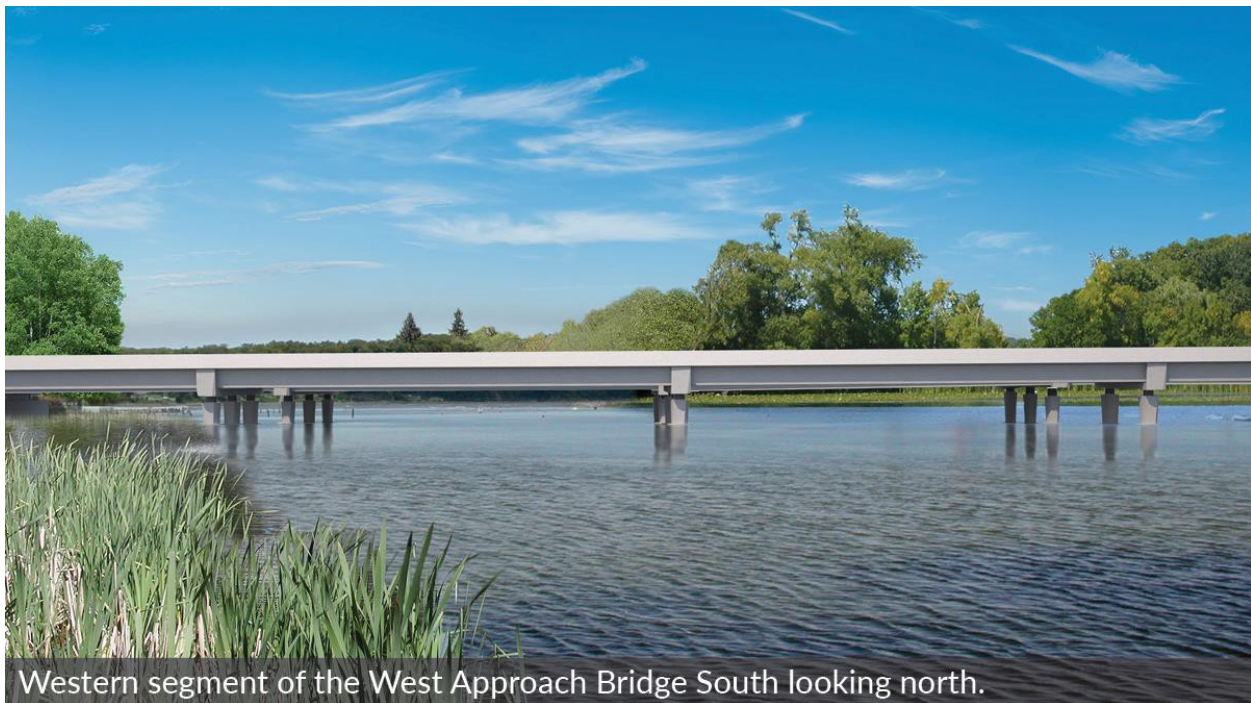
Western segment of the West Approach Bridge South looking north.