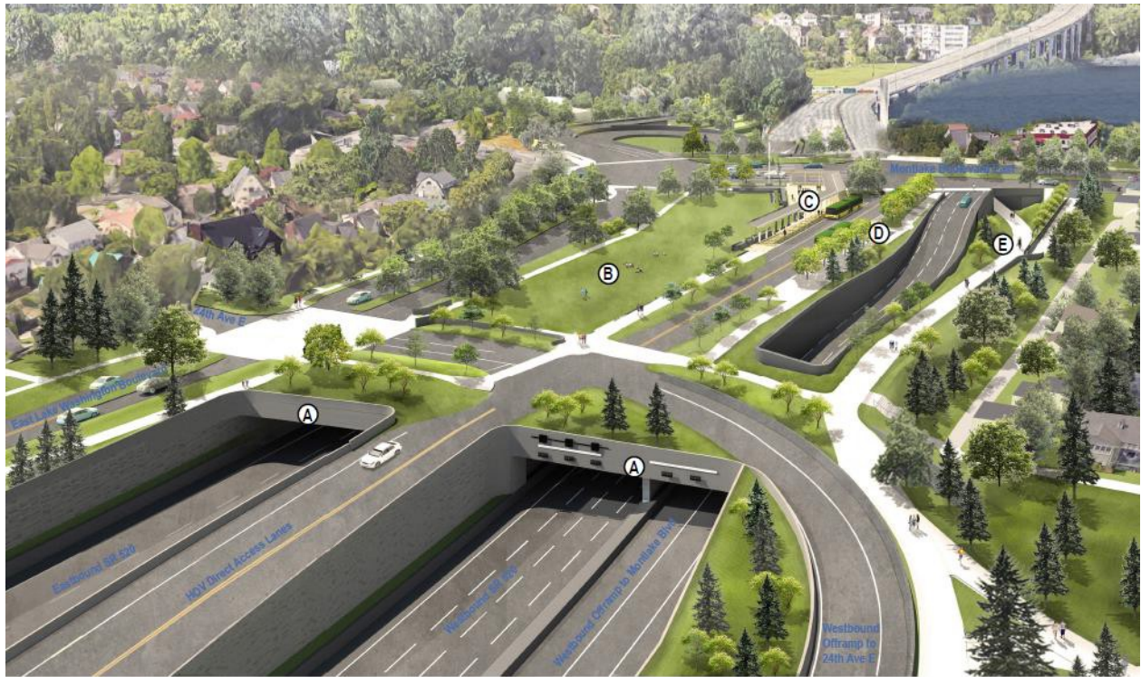
Figure 2 Final configuration looking west.